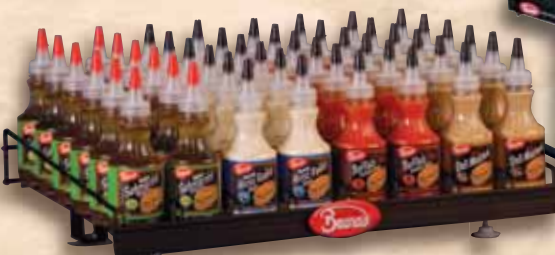
Counter Top Rack Holds 48 bottles

Floor Display Rack shown holds 144 bottles, also available one-sided which holds 96 bottles